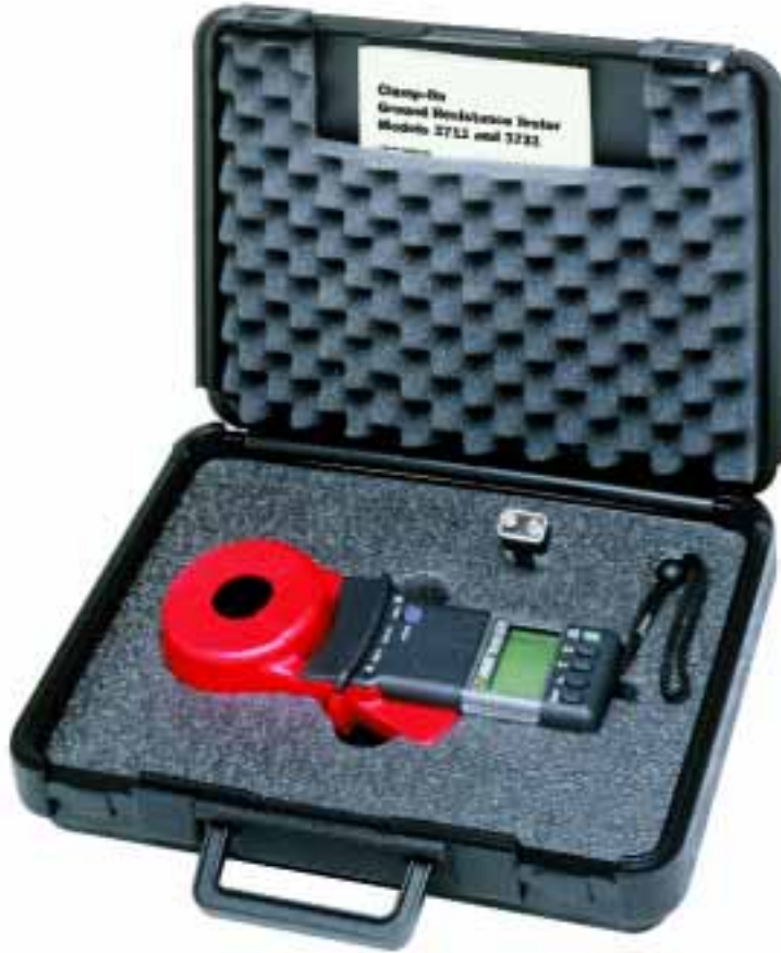
Clamp-on Ground Resistance Tester Models 3711 & 3731 include calibration loop, battery and user manual in hard carrying case.